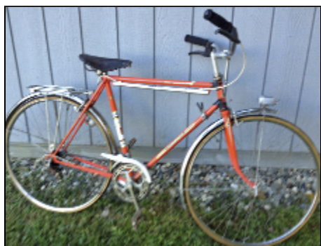
Above: 5-speed Peugeot Bike.