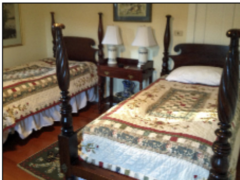
Above: Mid-19th century mahogany low-post twin bed.

This year's new format dubbed, " Sale on the Screen ," where items are listed online for sale through "craigslist" and our church website, is proving to be very successful. Listing items that have an anticipated minimum value of $50 has to date raised over $1000. We have sold everything from a ping pong table to a Bradford Voight watercolor. We currently have two mid-19th Century Mahogany