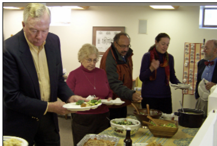
Parishioners partake of a potluck lunch prior to the Annual Meeting on January 27.