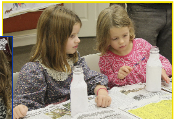
Young artists at work