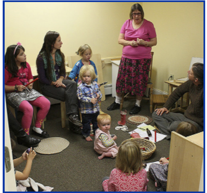
Children learn about Operation Christmas Child