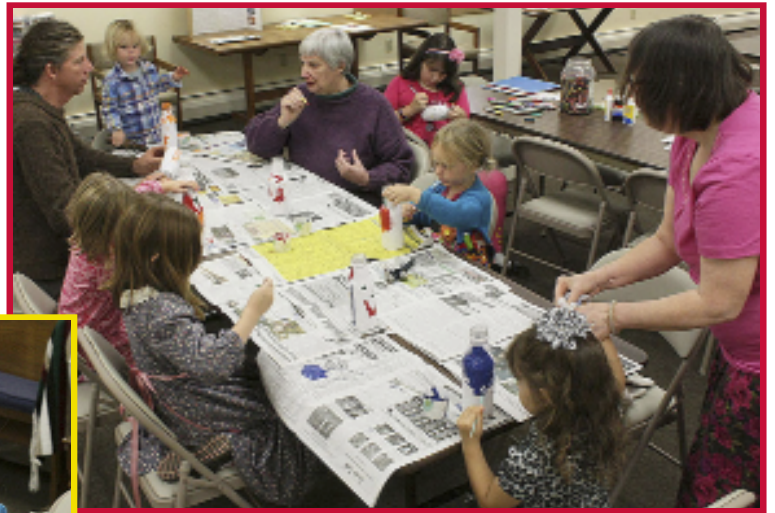
Making maracas from recycled plastic bottles