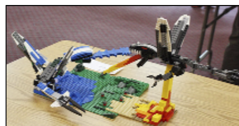
An awesome LEGO dragon.