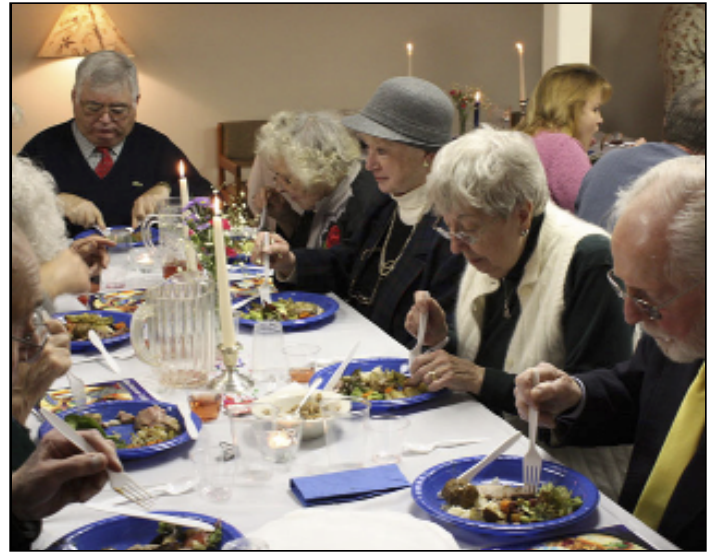
Guests enjoying a Seder Meal at St. Luke's in April 2009.