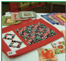
Quilted Gift Items