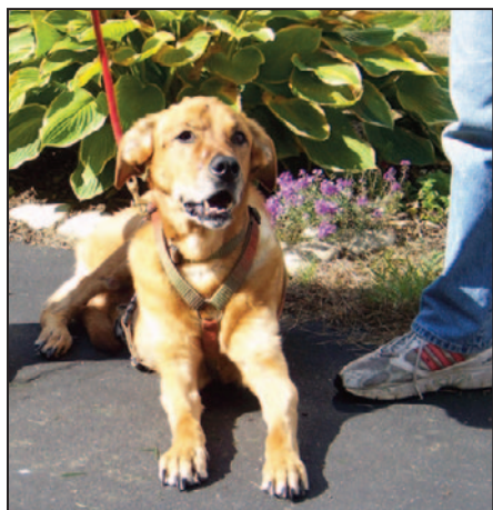
"Magic" enjoyed the homemade treats.