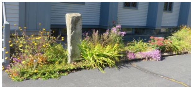
One garden's farewell to summer before the recent cold nights.

A list of some of the available items will be featured on the church website in a couple of weeks so people can preorder their selections.