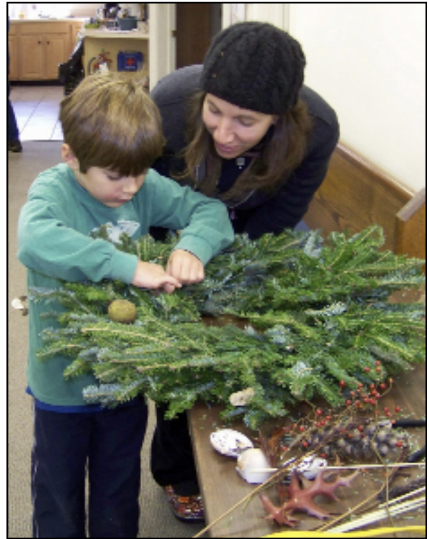
A great family activity as you can see by these photos. An event enjoyed by all generations.