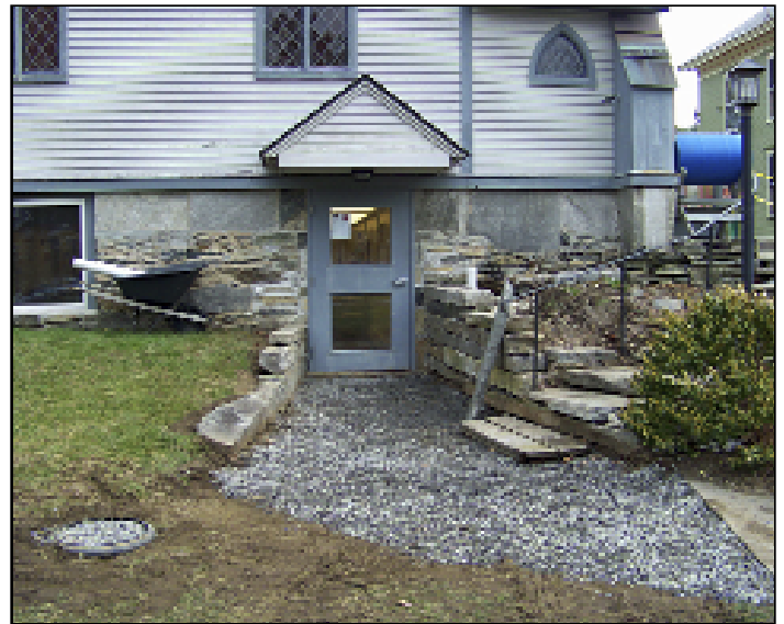
Grading work in progress at the entrance to Willard Hall.

final work. Blacktop there will be applied when the ramp is constructed out front.